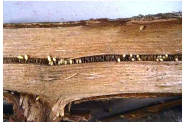
Plate 3. Egg laying.

Incubation period: The eggs hatched within 10-15 d after being laid by the insect pest in and adjacent of the crevices. The color of eggs changed from creamy white to pale white with the passage of time. The size of the egg observed was 2-3 mm in length and 0.1-0.2 mm in breadth at 20-25°C and relative humidity about 62% min and 96% max. Thus, the incubation period 12-13 d under temperature below 35°C reported in Aeolesthes sarta by Ahmad et al. (1977) was not confirmed by the present author under investigation.