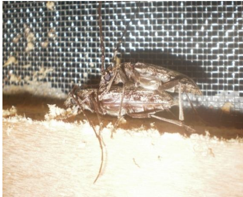
Plate 2. Antennae in males directed upwards during copulation.