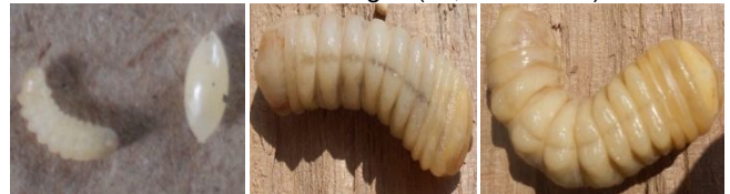
Plate 4. Larval stages (1 st , 2 nd and 3 rd ).

Number of larval instars: To study the number of larval instars directly of infested Juglans regia trees is impossible because of their big size and toughness of wood. To ascertain the number of larval instars, the author cut the small blocks of various sizes of the branches of walnut tree and put the male and female pair of Aeolesthes sarta in separate rearing cages along with the blocks of walnut. The author has ascertained the three larval stages of the pest concerned from the blocks of walnut (Plate 4).