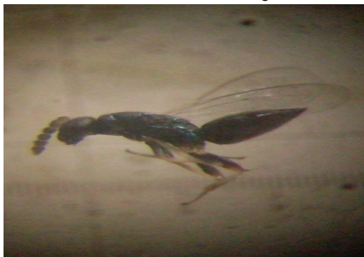
Plate 1 shows parasitoid emergence from larva. The parasitoid larvae measuring 2.1 mm (length) and 0.5 mm (width) had an average longevity of 4.4 \pm 1.14 d before pupation. The pupa measuring 1.3 mm (length) and 0.7 mm (width) is black in colour and also ovoid in shape (Plate 2). Adults emerged after an average of 7.4 \pm 2.07 d.

Adulthood: Female adult parasitoids with body length (3.0 mm), width (0.9 mm) and wings 2.0 mm had an average longevity of 6.3 \pm 2.63 d (Table 2). They are completely black (Plate 3). Adult parasitoids are usually free living and highly mobile, being proficient at searching for hosts (Hoedjes et al. , 2011).